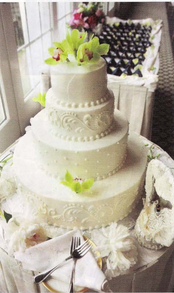
CLOCKWISE FROM TOP: The bride placed heirloom toppers on either side of the cake: one from her maternal grandmother's wedding (left) and the other from her parents' (right); the dashing groom, in a navy Zegna suit and silver Michael Kors tie, with his brothers; guests leave warm wishes and pictures in the guest book; the white scroll design on the ivory cake was reminiscent of the intricate beading on the bride's gown.